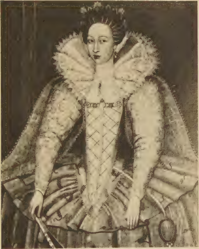
The Archduchess Harriet